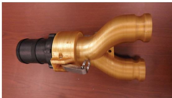
UTC Aerostructures designed a new fume collector for their facility using 3D printed ULTEM 1010 resin material.

This kind of material capability saved the Aerostructures business of UTC Aerospace Systems 63% on the cost of a replacement machine part for their factory. The division builds a number of large assemblies including engine nacelles, thrust reversers and pylons for aerospace companies like Boeing and Airbus. It typically uses its 3D printers for prototyping but has also used them to substantially reduce the cost and lead time to build replacement machinery parts, as well as tooling and fixtures.