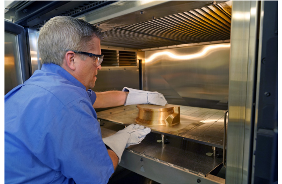
Team Penske counts on the reliability of FDM technology to help them win races, producing race-ready car parts and tools like this composite lay-up mold.

To determine how the FDM process compares with other AM methods for repeatable parts with consistent properties, Stratasys performed a comparative study. The primary objective was