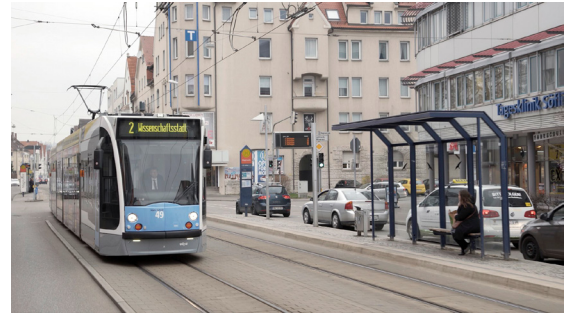
FDM technology helps keep the trains in Ulm, Germany, running.

Siemens opted to use their Fortus 900mc 3D Printer, a close relative to the F900, for this scenario. "Before we integrated 3D printing into production, we were limited to higher quantities of parts in order to make the project cost-effective. For small-volume part demands, we would store