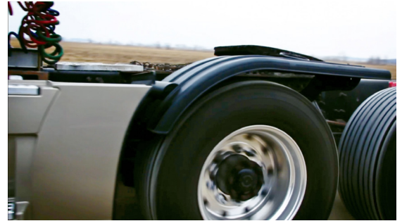
Minimizer put their ULTEM 9085 resin material prototype fenders through real-world functional testing.

Using their onsite 3D printer, Minimizer built functional prototypes of the large truck fenders in a few days using black ULTEM 9085 material. The black color lets Minimizer make concept models look more like production parts. “About 90 percent of our products are black in this industry,” says Minimizer CEO Craig Kruckeberg. Black ULTEM models look like the real thing right out of the build chamber, which is helpful for a business that’s constantly trying out new ideas.