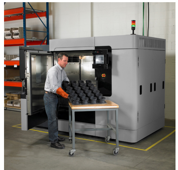
FDM technology is manufacturing-ready, with the most build volume for large parts or multiple smaller parts.

When Henry Ford developed the assembly line that heralded the genesis of mass production, a key requirement was the need for consistent parts and assemblies. Without it, there would be no guarantee that part A would fit with part B further down the line. Quality assurance plays a role in