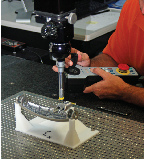
This CMM inspection fixture was created in a fraction of the time it would take to manufacture metal tooling.

An example where AM inspection tooling can be “doubled up” is with CMM fixtures and surrogate parts. First-article inspections on new products usually require setup of inspection fixtures to determine that the parts meet specs. But until the first article is produced, validation of the inspection program has to wait, adding delays. Instead of waiting, an accurate first article can be 3D printed and used to verify the CMM programming. It’s just one example of how you can leverage additive manufacturing in multiple ways to save time and expedite production.