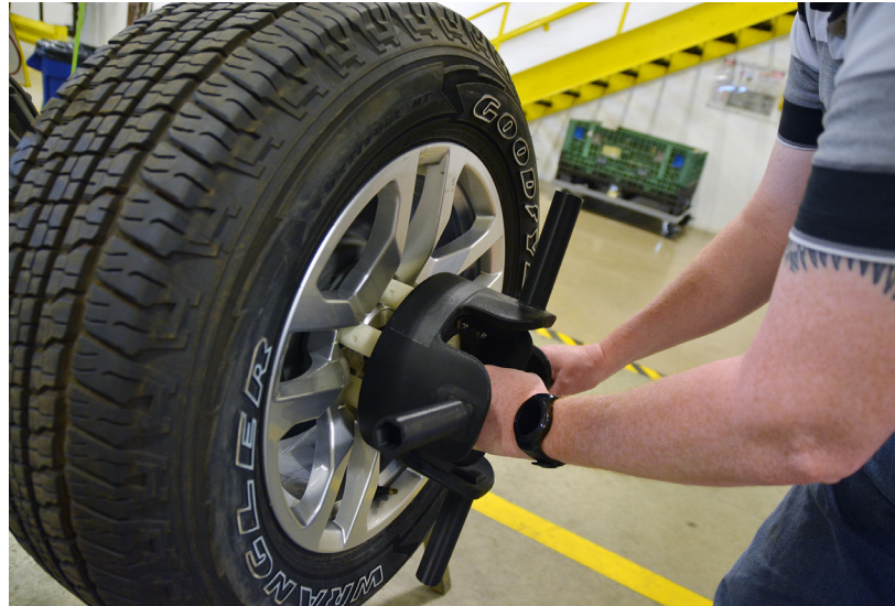
This 3D printed assembly tool provides a lighter, faster means of installing wheel lug nuts.

3D printing lets you iterate your tool design much more efficiently. Print the tool, try it and if changes are needed, revise the CAD design and print another one. This allows you to optimize and achieve the best tool design. In most cases, this wouldn't be possible with machined tools due to the time and cost involved.