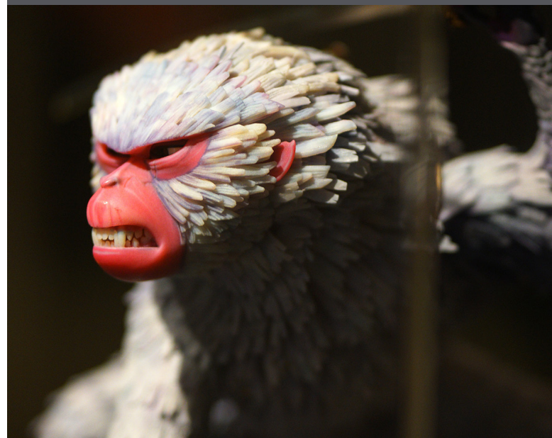
Monkey from "Kubo and the Two Strings," LAIKA's fourth feature film.