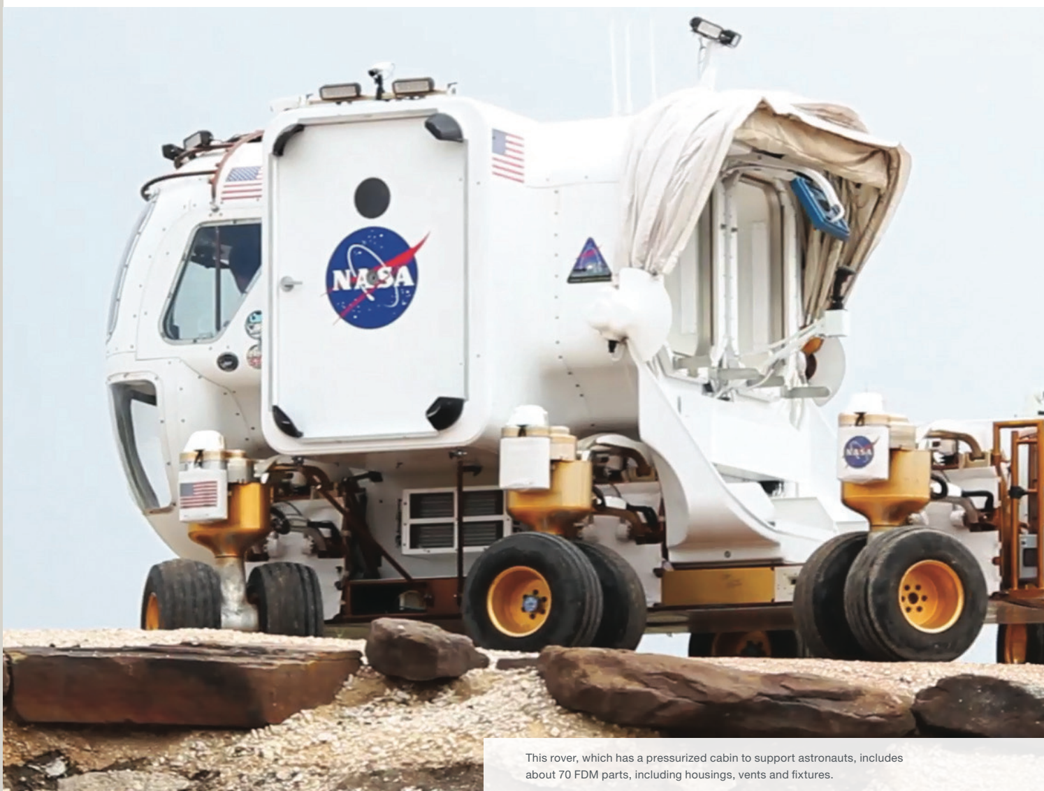
This rover, which has a pressurized cabin to support astronauts, includes about 70 FDM parts, including housings, vents and fixtures.

Watch a video of the rover’s story online at Stratasy.com/Rover .